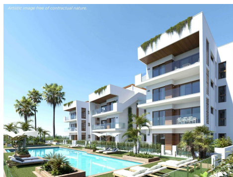
Artistic image free of contractual nature.