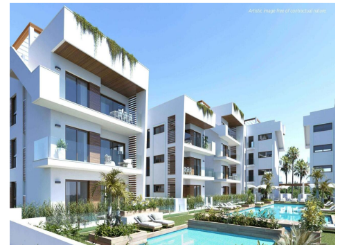
Artistic image free of contractual nature.

New Mediterranean-style residences in Los Alcázares, Costa Cálida; Modern coastal living in a prime location; Discover this exclusive new development in Los Alcázares, a charming coastal town in the Region of Murcia known for its relaxed Mediterranean atmosphere, golden beaches and year-round sunshine. The complex combines modern design, comfort and style to create a unique residential experience in one of the most sought-after coastal areas in southern Spain; Los Alcázares boasts 7 kilometres of coastline along the Mar Menor, a natural saltwater lagoon famous for its calm,...(Ask for More Details!)