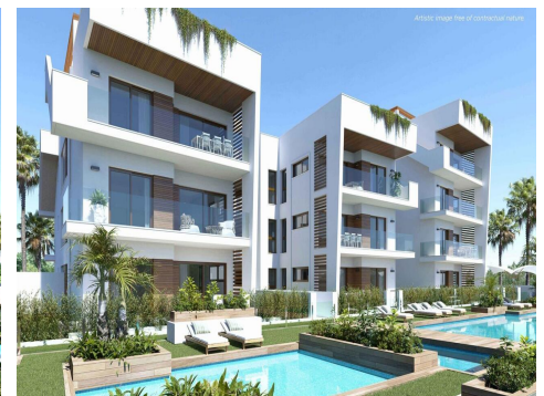
Artistic image free of contractual nature.