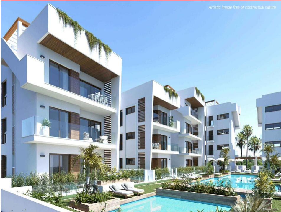
Artistic image free of contractual nature.