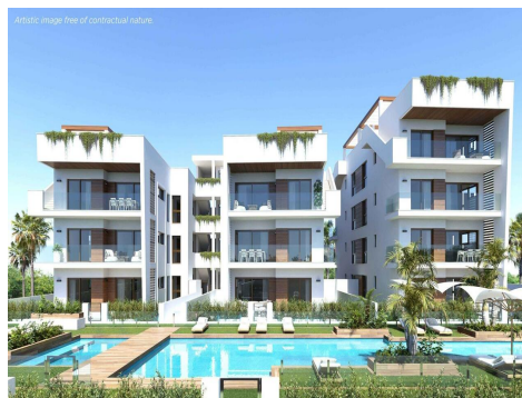
Artistic image free of contractual nature.